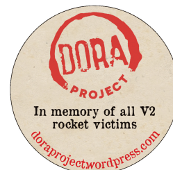
DORA PROJECT Newsletter 01/2016.